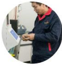
Pull out test