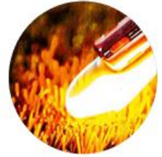
Flame retardant test